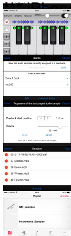
***: iPhone 2G and iTouch (classic) version screen shots ***